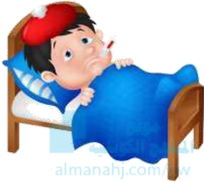
Adel - sick

☆ Write 3 sentences (one theme) using guide words and pictures about "Unhealthy Food"