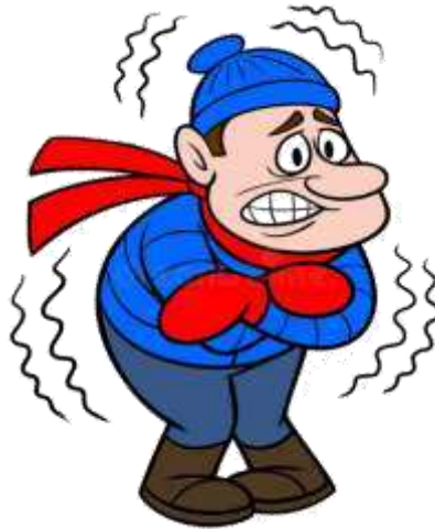
weather - cold