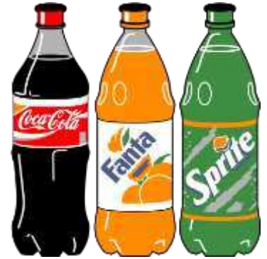
drink - fizzy

Adel is sick. He eats unhealthy food. He drinks fizzy drinks.