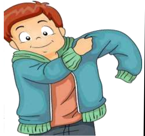
wear - jacket

It rains in winter. The weather is cold. I wear a jacket.