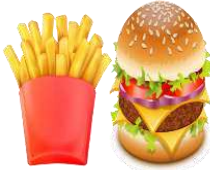
unhealthy - food