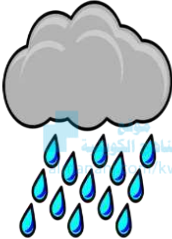
rain - winter

☆ Write 3 sentences (one theme) using guide words and pictures about "Winter"